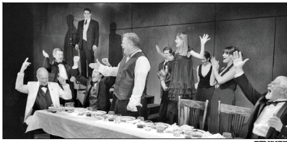
The large cast of "Festen" at Pawtucket's Sandra Feinstein-Gamm Theatre deals with confrontations that are no less painful for their being laugh-out-loud funny.

The film "Festen" (released in the United States as "The Celebration") was made under the rules of